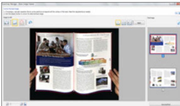
Book image correction Flattens and corrects curve distortion.