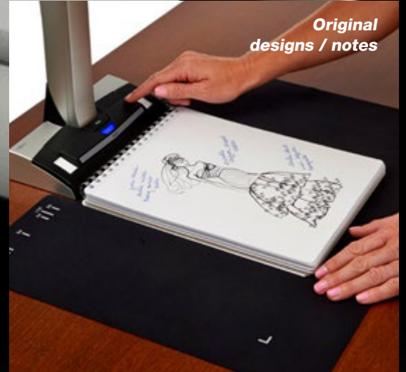
Original designs / notes