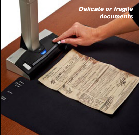
Delicate or fragile documents