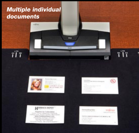
Multiple individual documents