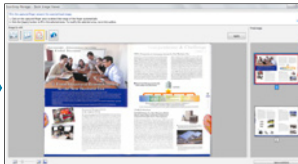
Point retouch function Fingers captured during scanning can be removed.