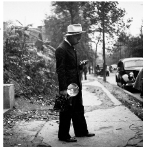
Photographer Charles "Teenie" Harris stands on a sidewalk holding his camera in Pittsburgh, ca 1938.

Charles "Teenie" Harris (1908–1998), one of the most prolific Black photographers of the 20th century, created a visual chronicle of African American life during his decades-long career as a photojournalist for the Pittsburgh Courier between 1935 and 1975. The Courier was one of the most influential Black newspapers in the United States,