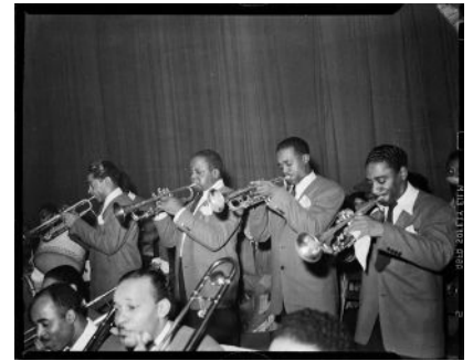
Brass section of the Billy Eckstine Orchestra, performs at Hill City Auditorium (Savoy Ballroom), Pittsburgh, October 1944.

standards speaks to Crowley's dynamic leadership. By partnering with a firm that understands both the nuances of archival material and the demands of public accessibility, CMOA ensured that their digitization efforts not only met professional benchmarks but also set a strong precedent for future collaborative projects of this scale.