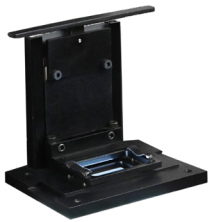
35 mm film strips