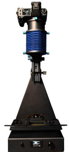
Fully equipped version