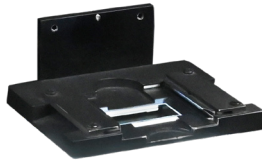
35 mm slides