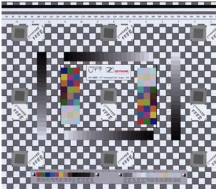
Fulfills ISO 19264-1 Level A, Metamorfoze Full and FADGI 4 Star