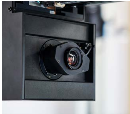
Camera system based on a CMOS sensor