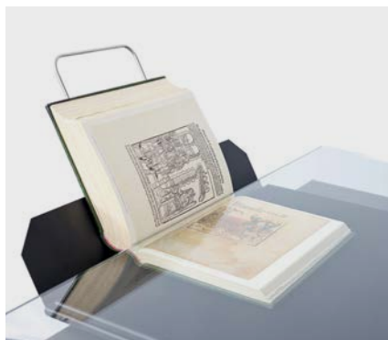
Various book holders optionally available