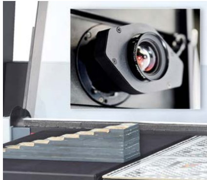
High depth of focus - electronically adjustable aperture