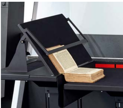
Bookholder on Copyboard OT 180 H 35 XL