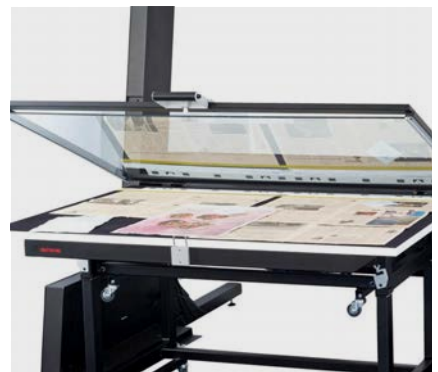
Toplight Table AT 0 with opened glass plate