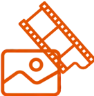
Graphic Arts Scanning