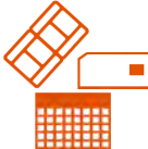
Microfilm, Microfiche and Aperture Card Scanning