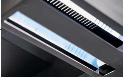
LED lighting system for reflection-free and shadow-free results