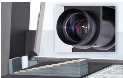
High depth of focus – mechanically adjustable shutter