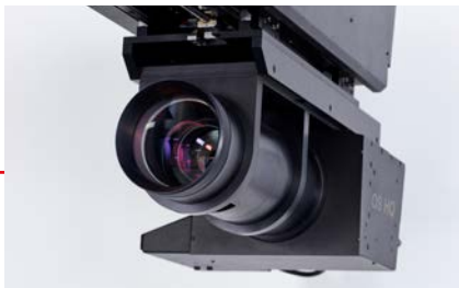
GigaPixel camera system with a CMOS-based line sensor