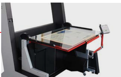
Wide range of interchangeable imaging systems