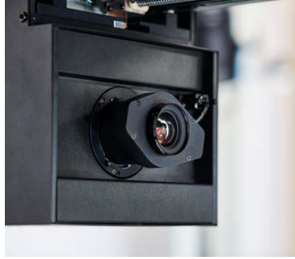
Camera system based on a CMOS sensor