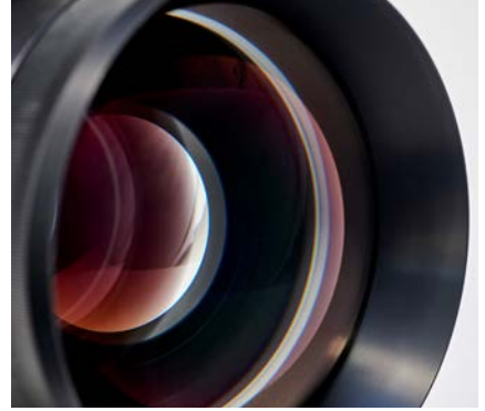
Perfect interplay between high-quality technical components