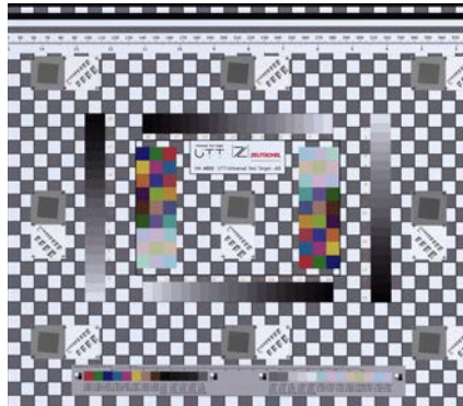
Fulfills ISO 19264-1 Level A, Metamorfoze Full and FADGI 4 Star