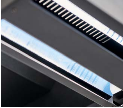
LED lighting system for reflection-free and shadow-free results