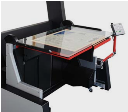
Wide range of interchangeable imaging systems