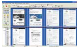
The AVScan X main screen

-The Intelligent Document Management Tool