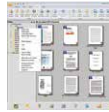
The PaperPort SE14 main screen

- The Professional Choice to Organize and Share Your Documents