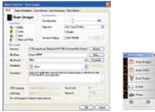
The Button Manager V2 main screen

Button Manager V2 makes it easy for you to scan and send your image to your favorite destinations with a press one button. Now the new version comes with an innovative feature to let you scan and automatically upload the scanned document to popular cloud repositories such as Google Docs, Microsoft SharePoint, or FTP. In addition, the iScan feature allows you to insert the scanned image or recognized text after optional OCR (Optical Character Recognition) process to your text editor such as Microsoft Word to get your job done easily and quickly.