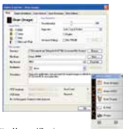
The Button Manager V2 main screen

Button Manager V2 makes it easy for you to scan and send your image to your favorite destinations with a press one button. Now the new version comes with an innovative feature to let you scan and automatically upload the scanned document to popular cloud repositories such as Google Docs, Microsoft SharePoint, or FTP. In addition, the iScan feature allows you to insert the scanned image or recognized text after optional OCR (Optical Character Recognition) process to your text editor such as Microsoft Word to get your job done easily and quickly.