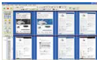
The AVScan X main screen

-The Intelligent Document Management Tool