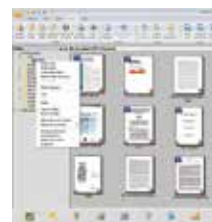
The PaperPort SE14 main screen

- The Professional Choice to Organize and Share Your Documents