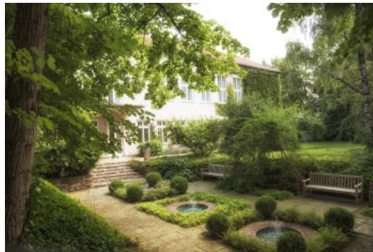
Garden side of Orff-Zentrum Munich

The entire documentary components and a large proportion of Carl Orff's artistic estate are located in the archives of the Orff Center Munich and on permanent loan from the Carl Orff Foundation.