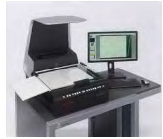
■ OS 15000 Advanced Plus: Scanning of large formats