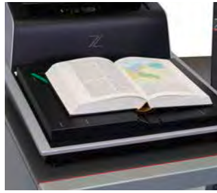
■ Book cradle OS 15000 Comfort