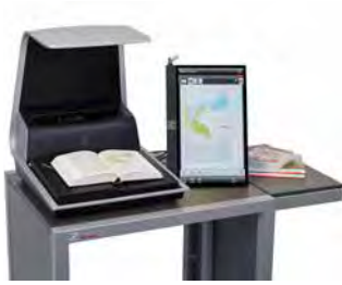
■ OS 15000 Comfort with touch panel and zeta Software