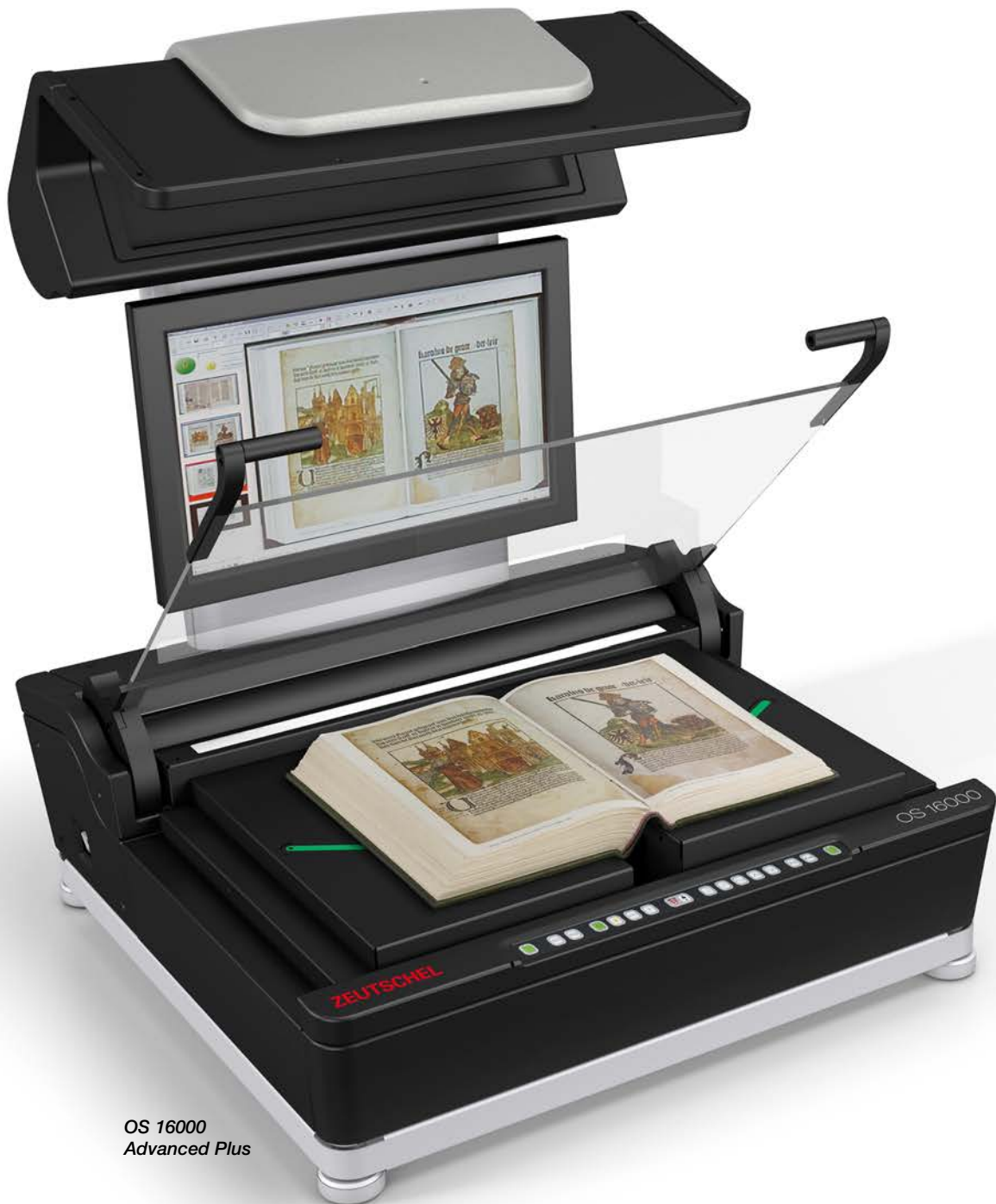
OS 16000 Advanced Plus