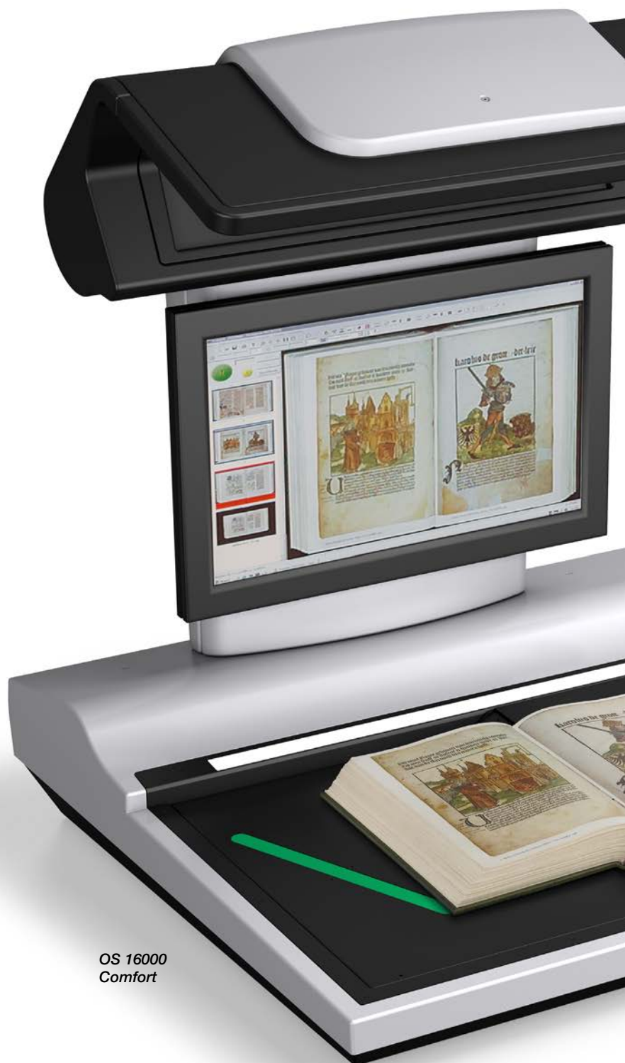
OS 16000 Comfort

The OS 16000 book scanner meets the needs of our users. Powerful production scanners that are gentle to the book, yet very comfortable to handle. The homogeneous, shadow-free illumination and superior scanning technology ensure images are of excellent quality. Automatic lowering and autostart guarantee high throughput.