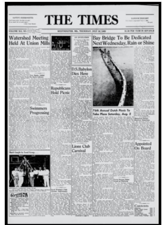
This issue of the Carroll County Times from July 24, 1952, featuring an article on the dedication of the Chesapeake Bay Bridge, was digitized on a MACH5 roll film scanner and processed using Mekele's Quantum software. CCPL chose to have a slight border to ensure no data had been lost.

CCPL applied for, and was awarded, a Library Services and Technology Act (LSTA) grant from the Maryland