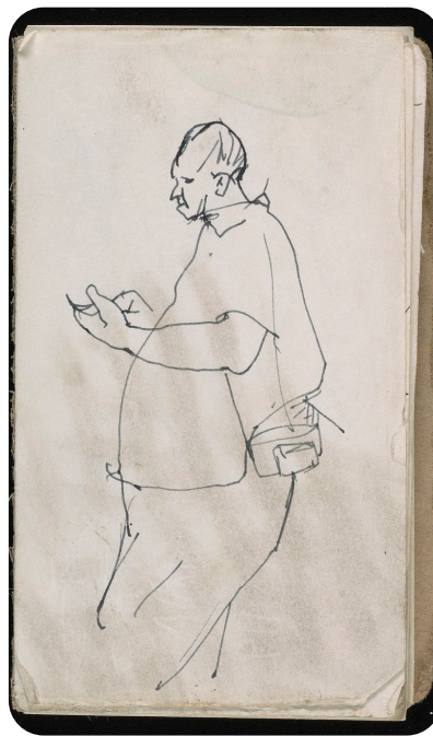
Photo credit: Ben Shahn, Sketchbook circa 1930s-1960s, Box 28, Folder 44.

over 16 million items, as of this study's first print, and with more than 1.5 million available in online collections, AAA has made significant progress toward this goal.*